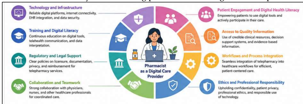
Figure 3. Enablers Supporting Role of Pharmacists in Tele pharmacy & Digital Healthcare

Telepharmacy offers multiple advantages including improved healthcare accessibility, reduced travel burden, enhanced medication safety, cost-effectiveness, and better patient satisfaction. Rural and underserved populations particularly benefit from remote pharmaceutical services. Digital healthcare technologies improve workflow efficiency, reduce medication errors, facilitate early disease detection, and enhance interprofessional collaboration. Telepharmacy also contributes to continuity of care during public health emergencies and pandemics.